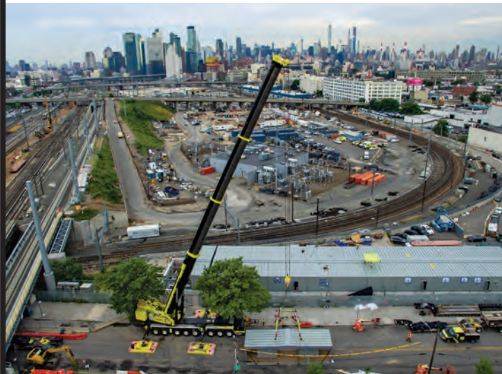
E-J Electric Installation Co. (No. 36) installs one of the last segments of the largest prefabricated traction power substation in the U.S. for Long Island Railroad's East Side Access Program. The building stretches 250 ft.